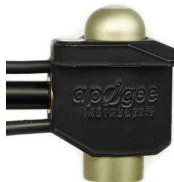
AM-130 Albedometer Mounting Fixture with 12" Rod