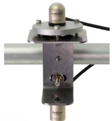
AL-130 Albedometer Mounting Bracket

Mount the SP-710-SS with an AL-130 albedometer mounting bracket or an AM-130 albedometer mounting fixture with a 12" rod. The SP-722-SS is mounted using an AM-150 mounting bracket or AM-500 mounting bracket. The AM-150 may be used to mount sensors directly to a solar panel.